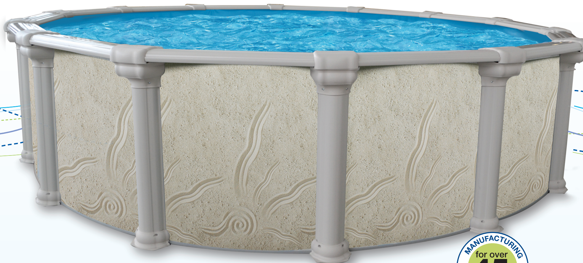
Round Monterrey - Sosua wall offered in 52 and 54".

Whether you prefer a Round or NBS or NBS EXP Oval pool, there's a MONTERREY above ground pool perfect for your yard. Whatever size or shape