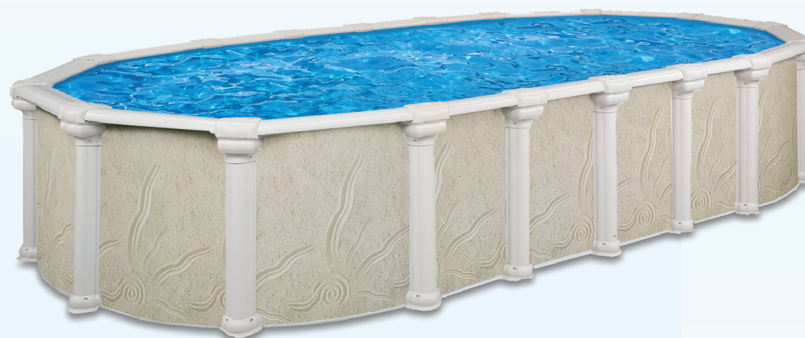
NBS oval Monterrey - Sosua wall offered in 52 and 54".