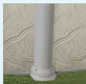
One-piece resin foot collar