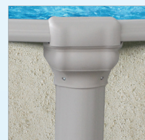
Ledge, cap and post designed for a secure fit